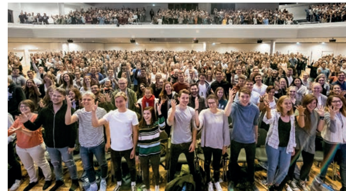
Welcoming new students in the first semester

Naturally, excellence in teaching and learning is our most important goal. In addition, we are proud of our international activities which range from excursions in foreign countries to study programs that are entirely taught in English. Did you know that we are the largest University of Applied Sciences in our federal State of Lower Saxony and the one that is most active in applied research?